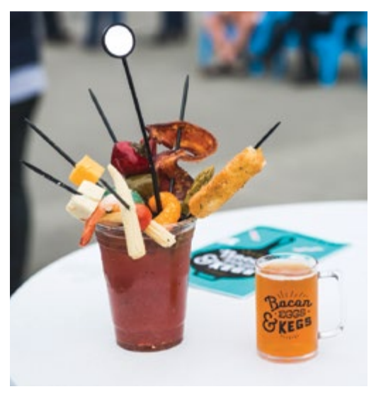
Watch for more details at northwestharvest.org/events.

MAY 30-JUNE 30 Northwest Harvest is grateful to partner with Heritage Bank in Washington on Heritage Helps! Did you know—1 in 6 kids live in a household that struggles to put food on the table? That's why from now until June 30, all Heritage Bank branches will have collection bins for kid-friendly non-perishable food items. You can also help by donating online at https://bit.ly/2lVihjq or by texting HERITAGEHELPS to 41444. Together, we can end childhood hunger! #HeritageHelps